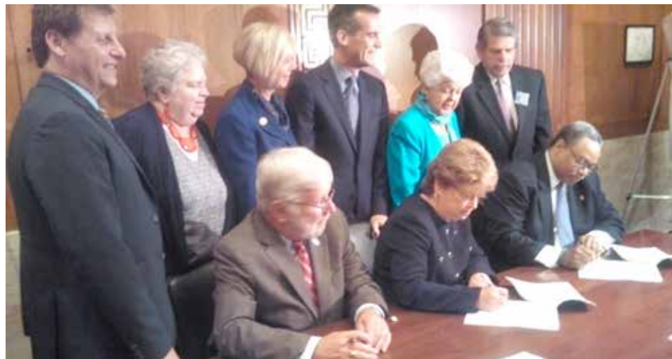
The signing of the funding documents.

With federal funding commitments now in place, Metro will soon recommend the selection of a design-build contractor. Preliminary construction activities for the first segment of the project could begin later this year, with completion of