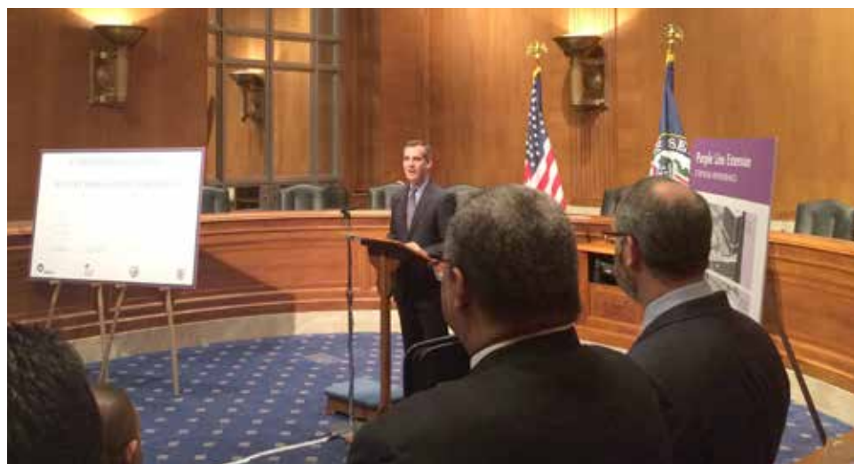
Los Angeles Mayor Eric Garcetti speaking at the signing in Washington D.C.